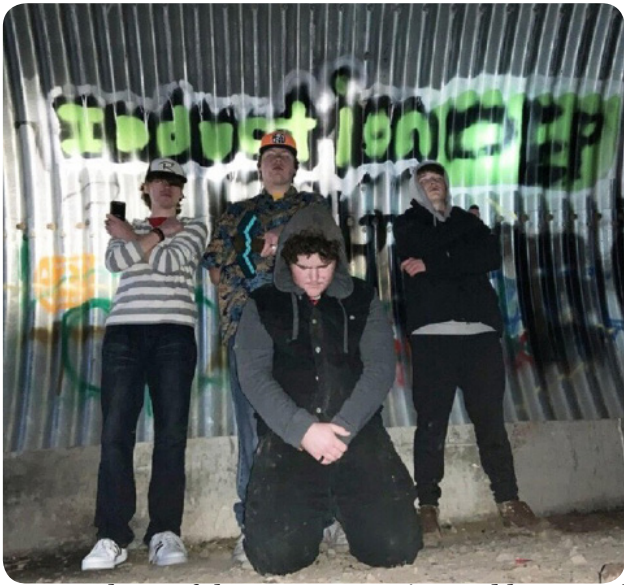
All four members of the group are pictured here on the album cover of The Miners first album, Induction.

Their album was made partially for their own entertainment, but mostly for a small following they had accumulated at our school, which delivered a quiet but very celebrated release. It consists of 8 songs, 2 of which are “skits,” a common feature of hip hop albums. When asked to describe their style, none of